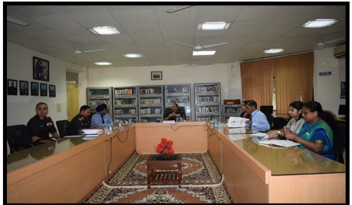
Meeting to Discuss Agenda Points