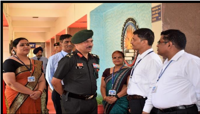
Interaction with Administrative & Non-Teaching Staff