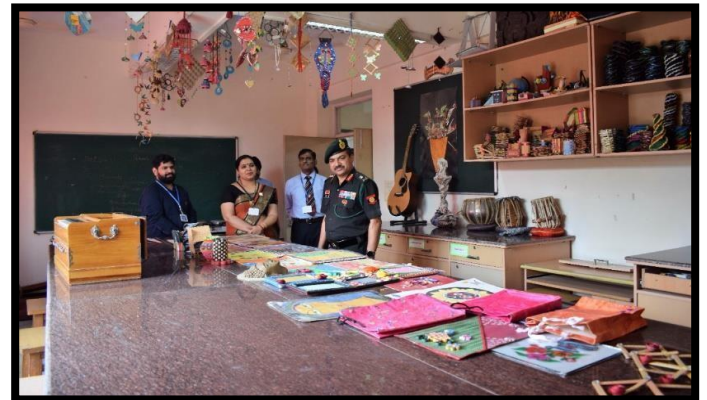
Visits to Resource Rooms