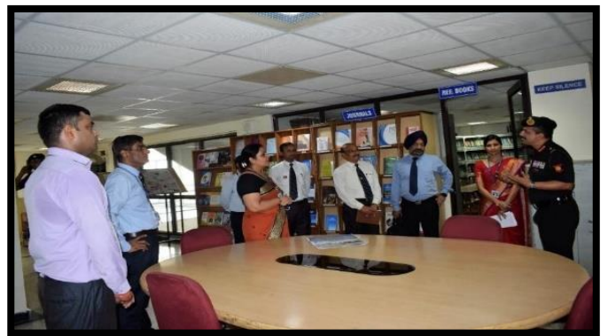
TEAM AAT Inspection Visiting Library and ICT Resource Room