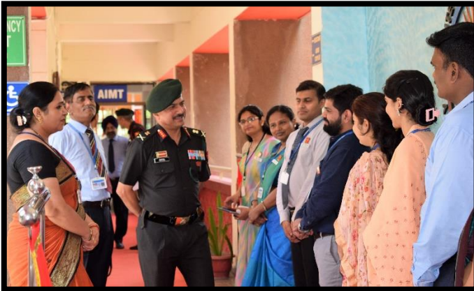
Interaction with Teaching Staff