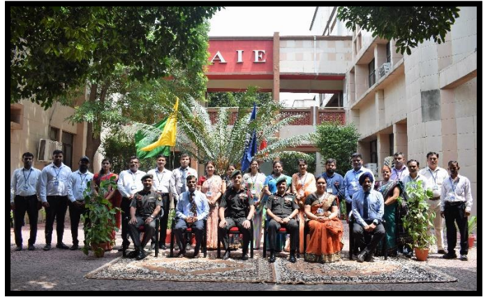
Group Photo with Teaching, Adm, & Non Teaching Staff