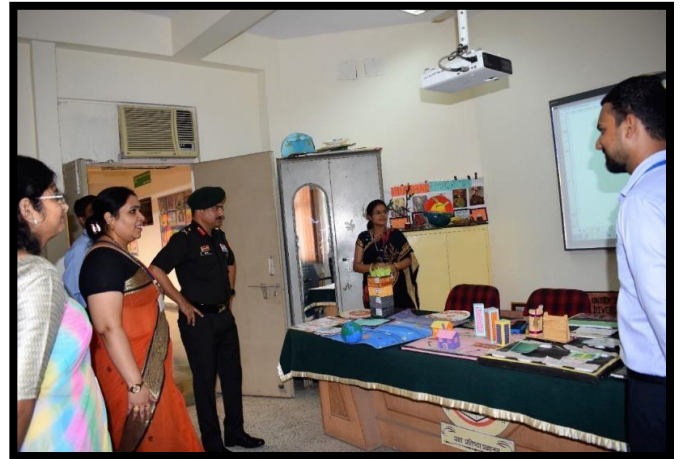
COS, HQ, WC Interacting with Resource In Charges and Students